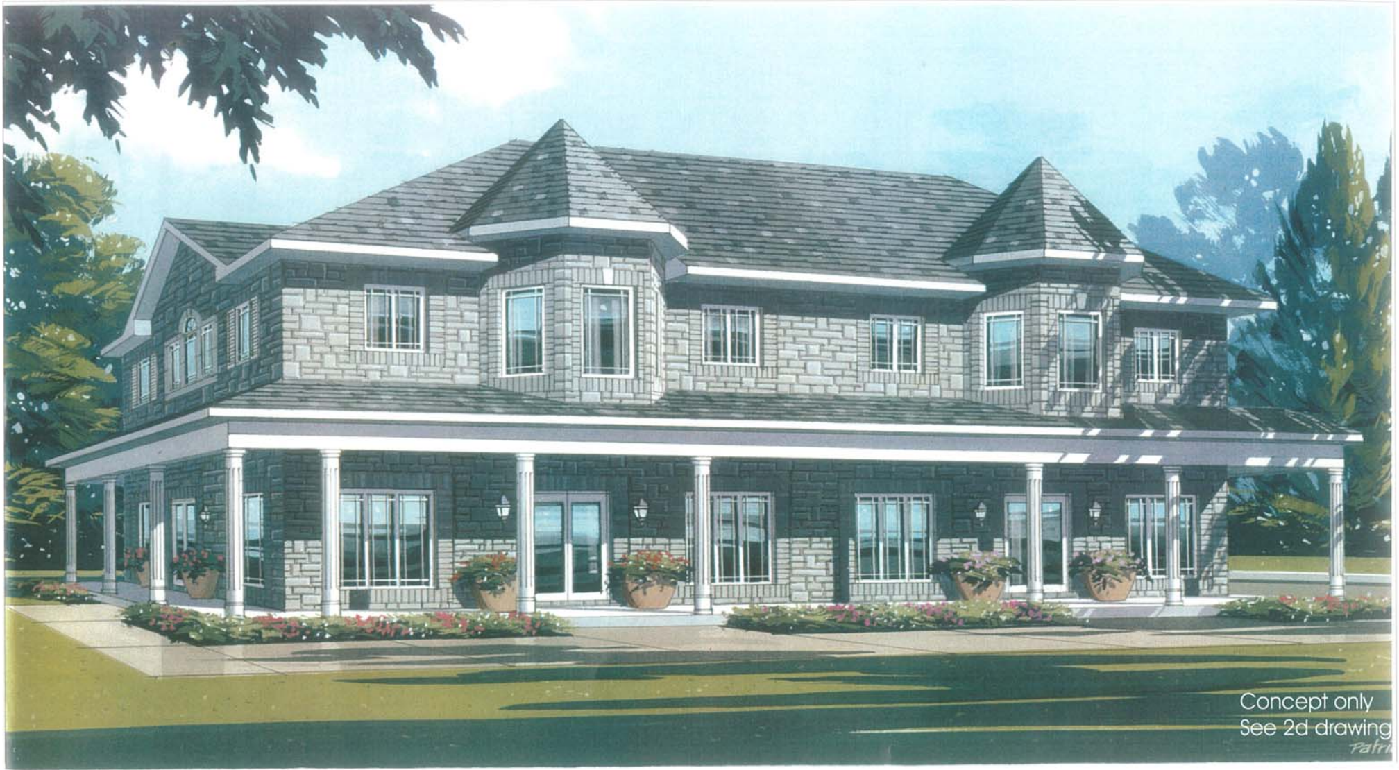
CENTENAIRE ST, EMBRUN MAIN FLOOR COMMERCIAL, SECOND FLOOR RESIDENTIAL