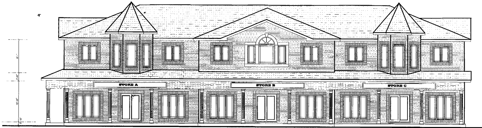
FRONT ELEVATION FROM CENTENAIRE STREET