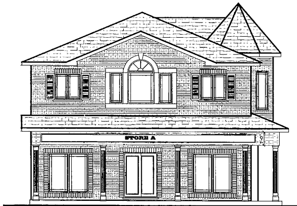
SIDE ELEVATION FROM NOTRE-DAME STREET